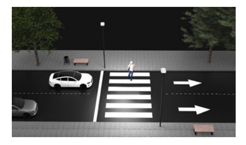
Two lanes and one direction. Both optics facing the left.