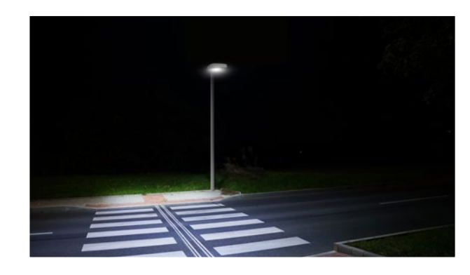
LIGHTING FOR CITIZEN SAFETY Crosswalks in city and inter-city streets, near schools and parks; streets with low foot traffic; residential neighborhoods; housing developments; pathways; bike lanes; parking lots, etc