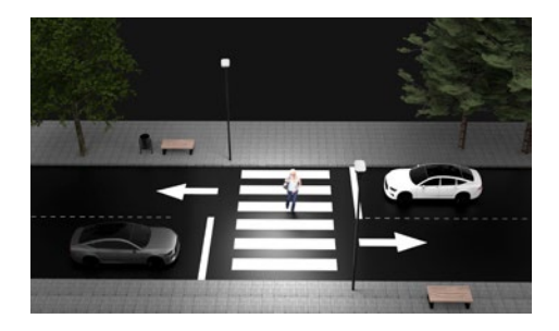
Two lanes and two directions. Both optics facing the left.

One lane and one direction. Both optics facing the left.