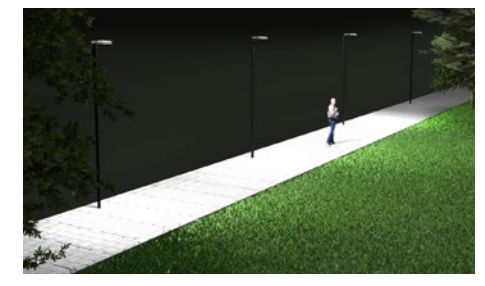
Progressive lighting. Asymmetric optic for walks.