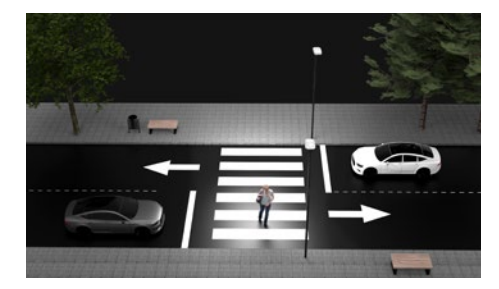
Two lanes and two directions. One optic facing the left and the other the right