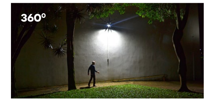
PATHS AND PEDESTRIAN AREAS: Detection angle of 360°, to detect pedestrians in all directions.

Detection angle of 180°, oriented toward the back part of the light to act when there are pedestrians on the sidewalk, without being confused by passing cars.